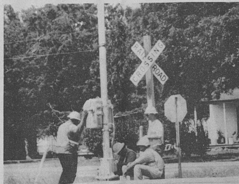
Guards go up

As of the first of this week, there are no more unguarded railroad crossings inside the City. Railroad workers finished installing the crossing arms, warning signals and lights during the early part of the week at the Walnut Street crossing.